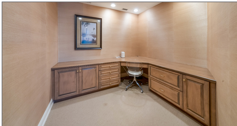
Additional office space located off of primary bedroom